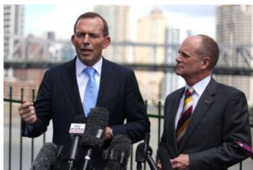
Prime Minister of Australia The Hon Tony Abbott MP at the launch of Australia's G20 presidency, with Queensland Premier Campbell Newman.